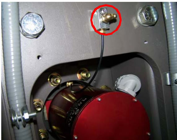
Installed Lube Line Kit